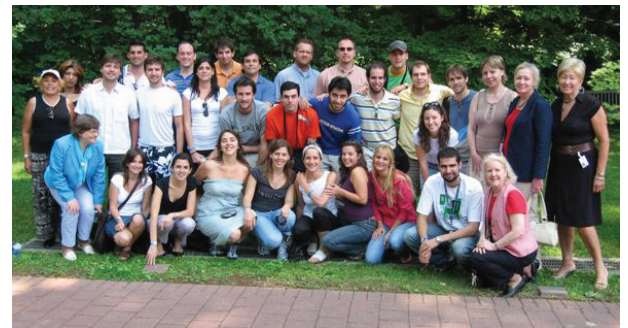
Fullbright Scholars from Argentina at a PTPDE reception for them at Winterthur.

Town Meeting presentations by US State Department speakers continue to be popular. Speakers often give talks at local high schools and Widener Law School as part of their Delaware itineraries.