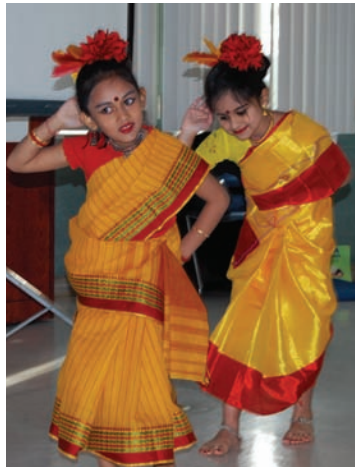
Indian dancers perform at PTPDE Families of India program for Girl Scouts.

Delaware has the highest participation rate in the nation for the Student Ambassador travel program. The Chapter gave scholarships of $2000 (matched by PTP International) and $1000 to two outstanding area students to help them participate in the program.