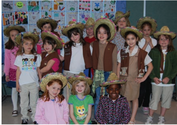
Scouts model hat bands they made for their sombreros.

The Families of the World programs include videos on a selected country with foods, entertainment and crafts to help introduce area children to the world beyond the USA. The Chapter donates the program costs.