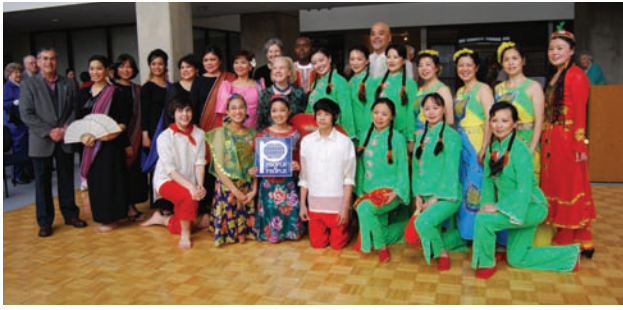
Dancers from the Philippines & China performed at a multicultural program at Cokesbury Village.